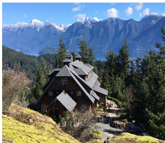
Rivendell Retreat Center, Bowen Island, B.C.